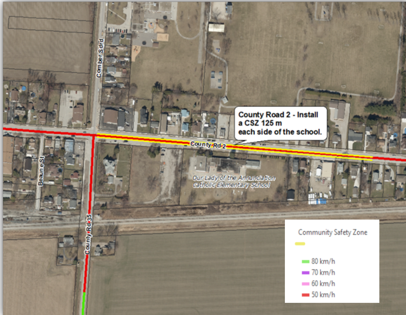
Figure 1 - County Road 2