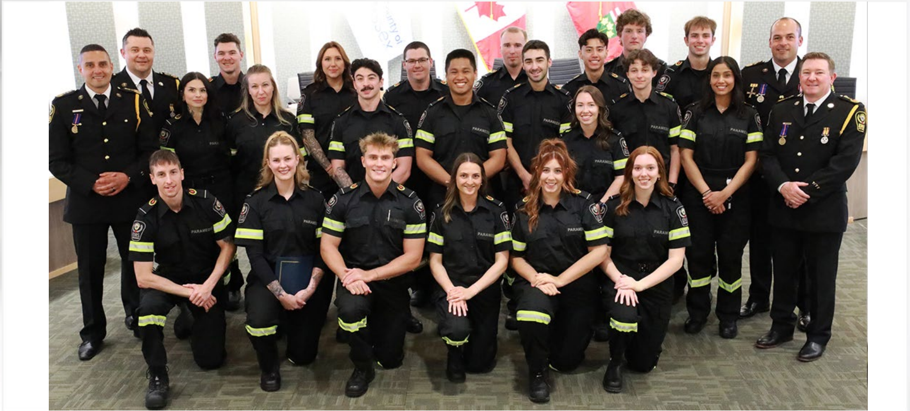
Emergency Medical Services