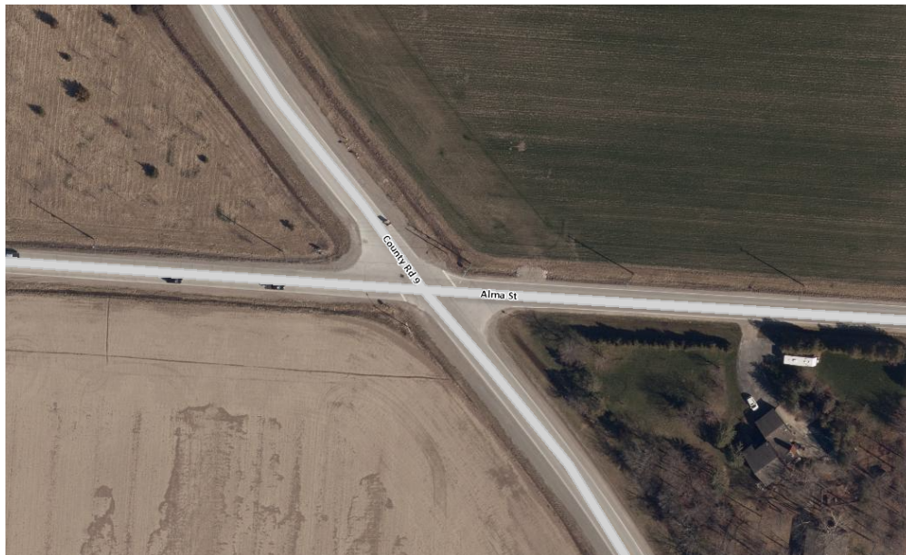
Figure 1: Aerial image of County Road 9 and Alma St. Intersection

The intersection of County Road 9 and Alma St. is a four-leg unsignalized intersection, with the eastbound and westbound approaches (Alma St.) being stop controlled. The subject intersection is shown in Figure 1 :