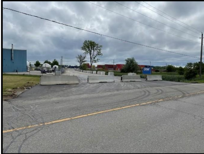
Figure 2: Example of physical enforcement action

Along with physical actions being taken such as the placement of barriers or removal of illegally placed fill, another action undertaken to help reduce the cost advantage of operating illegally has been to inform the Municipal Property Assessment Corporation (MPAC) through Finance staff of changes in use of the property and have the property reassessed. Often, illegal operators are surreptitiously converting farm properties to commercial properties and by informing MPAC of the actual use of the property appropriate taxes can be levied, ensuring equal treatment for legal and illegal operators. To date there have been 25 properties reassessed and this has resulted in more than a $384,000 increase in the tax levy for these properties; another 24 properties are still waiting to be reassessed. Staff also regularly inform our contacts at the Canadian Revenue Agency (CRA) of these operations as we have found that there is a significant amount of cash transactions between the vehicle operators storing their vehicles on the property and the operators of these yards. Staff also regularly communicate with other enforcement agencies such as the Toronto and Region and Conservation Authority (TRCA), Ontario Ministry of Transportation (MTO), Ministry of Environment, Conservation and Parks (MECP), and the Electrical Safety Authority (ESA) on these illegal operations and coordinate our enforcement efforts with them as much as possible.