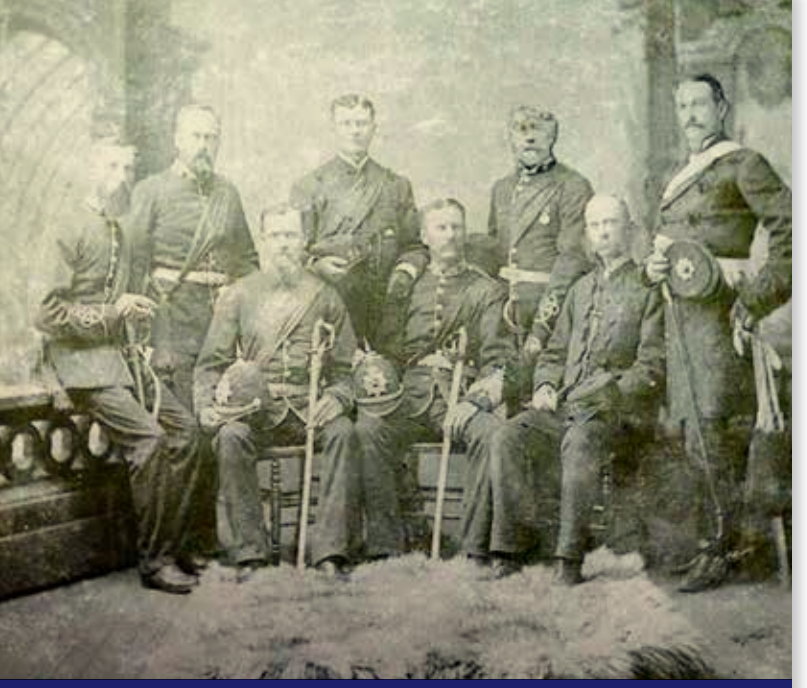
Protectors of our freedoms and values, 1882