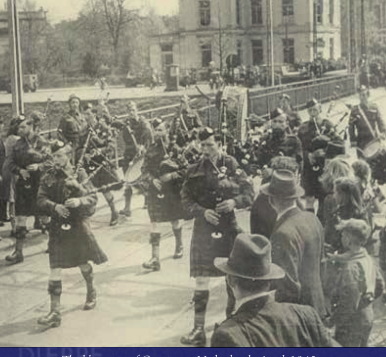
The liberation of Groningen, Netherlands, April, 1945