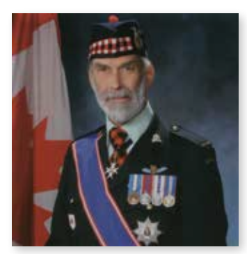
His Royal Highness Prince Michael of Kent, GCVO, CD, Colonel-in-Chief of The Essex and Kent Scottish

and Canada Day parades, funerals, and much more. All expenses, including dress uniforms, instruments, transportation etc.