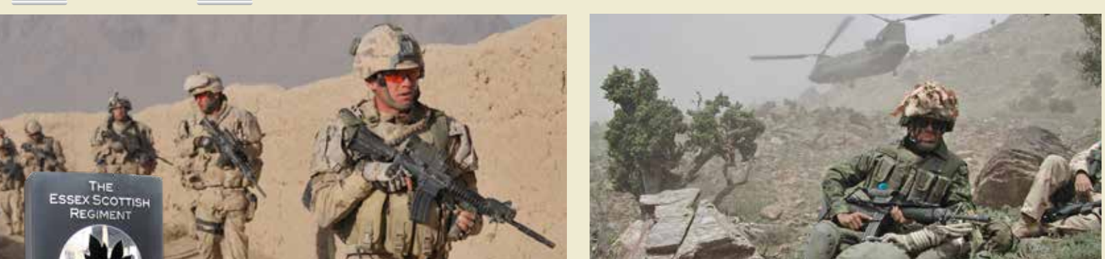
Delow. Members of The Essex and Kent Scottish pay tribute at the memorial in Dieppe, France. Above: Canadian soldiers in Afghanistan.

It falls to us, as a community, to honour their courage