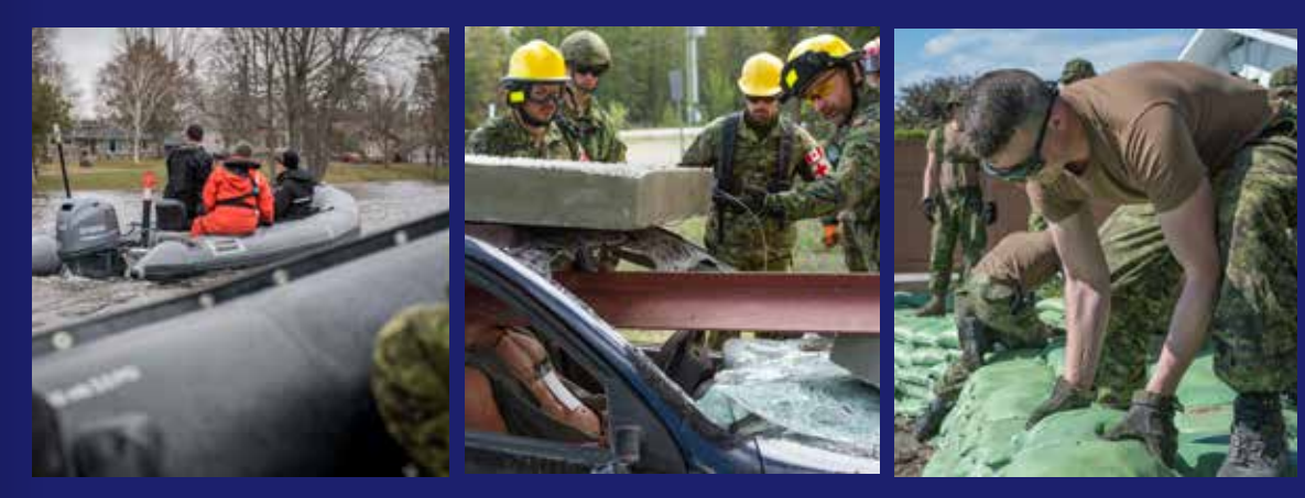
Canadian Armed Forces are actively engaged in a variety of domestic support roles. The Essex and Kent Scottish, like all of Canada's reserve units, play an essential part in delivering these emergency services.

The Essex and Kent Scottish continues to be a vibrant and cohesive force within both Essex and Kent counties, with a mandate to train citizen soldiers to the highest standards for both domestic and overseas deployment.