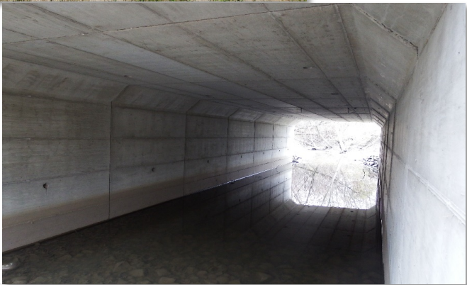
November 17, 2021